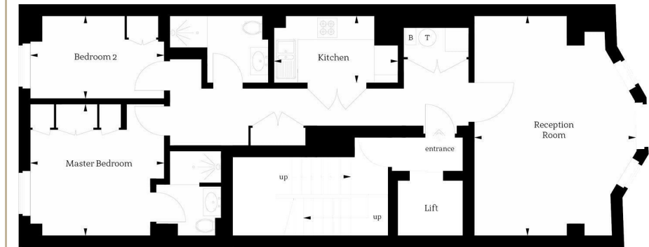
Apartment 2 - Second Floor